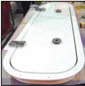
Two dog, Storage hatch