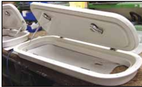
Two dog, Storage hatch, Open