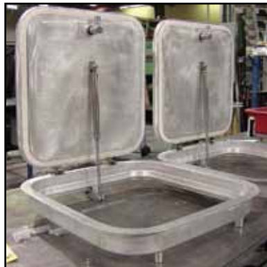
Single dog, Single gas spring, Surface hinges