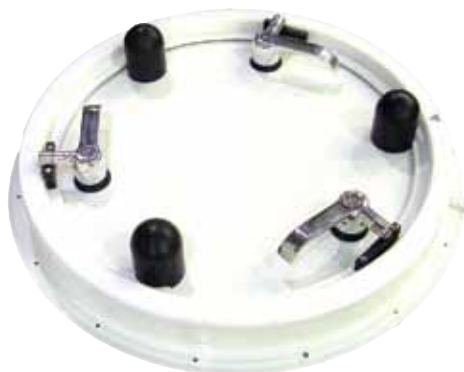
3130, escape hatch, lift-out, guide pins (interior view)