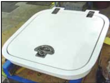
Flush D-ring dogged handle, Flush surface hinges