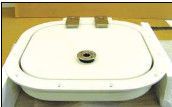
This 3130 custom deck hatch is prepped with raised surface hinges and bi-square for builder installed teak overlay.