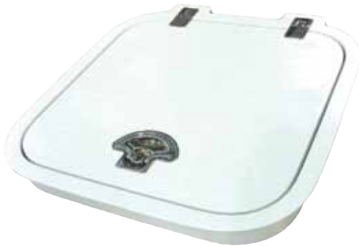
3130, flush D-ring dogged handle, flush surface hinges

FREEMAN MARINE custom fabricated Premium Duty hatches offer a wide range of options to meet virtually any specification. Rugged construction featuring thick panel skins (.160" up to .250"), internal reinforcements and smooth welded skins to assure the reliable service and refined appearance expected in FREEMAN fabricated individually dogged hatches. Premium Duty hatches are specified where frequent open position viewing and guest usage occurs. Hatches may be ordered with flush or proud - raised coamings. Camber and sheer requirements to match deck profiles are routinely crafted. Hatches can be specified with either surface or concealed hinges. Panels and coamings can be specified with custom alignment for teak overlaying by installation yard or builder.