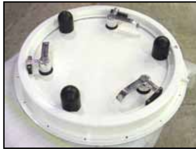
Escape hatch lift-out, Guide pins, Interior view